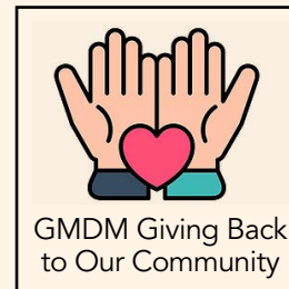
GMDM Giving Back to Our Community

RESERVATIONS REQUIRED; PLEASE NOTE ANY DIETARY RESTRICTIONS