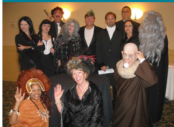
2009: The Addams Family visits our celebration.