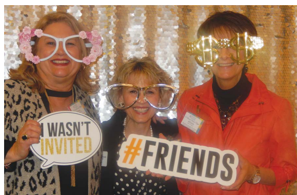
2019: It is hard to resist a good photo booth.