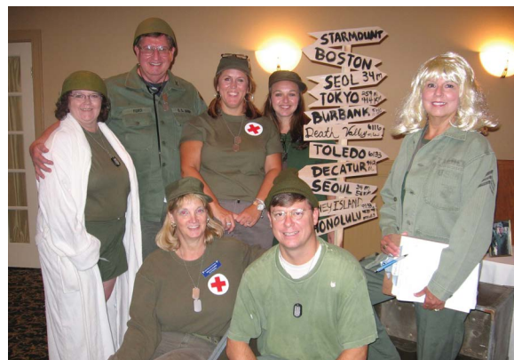
2010: The M*A*S*H crew reports for duty.