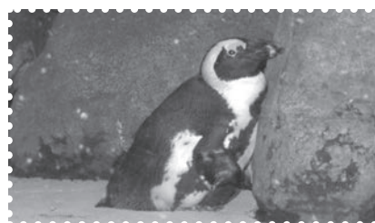
One of the many penguins in the Aquarium at the Greensboro Science Center.